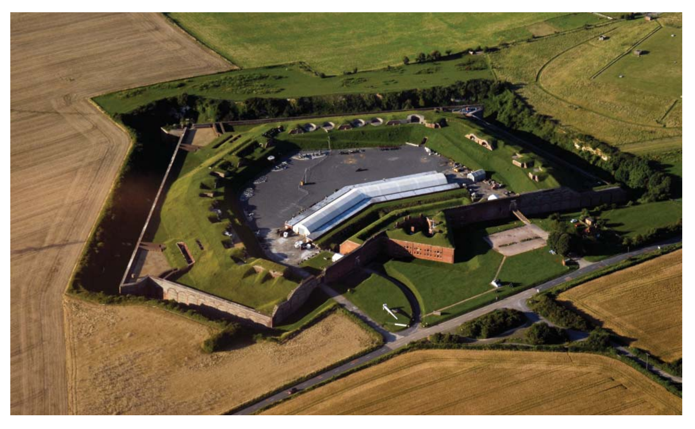
Above: The existing fort and visitor centre set into the landscape. Right: The new entrance to the fort