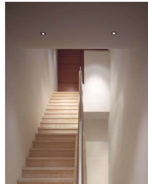
Above: entrance and stair, 56 Long Acre