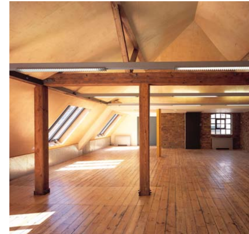
Left: refurbished fourth floor loft space, 48-51 Floral Street Below: new stair, 48-51 Floral Street