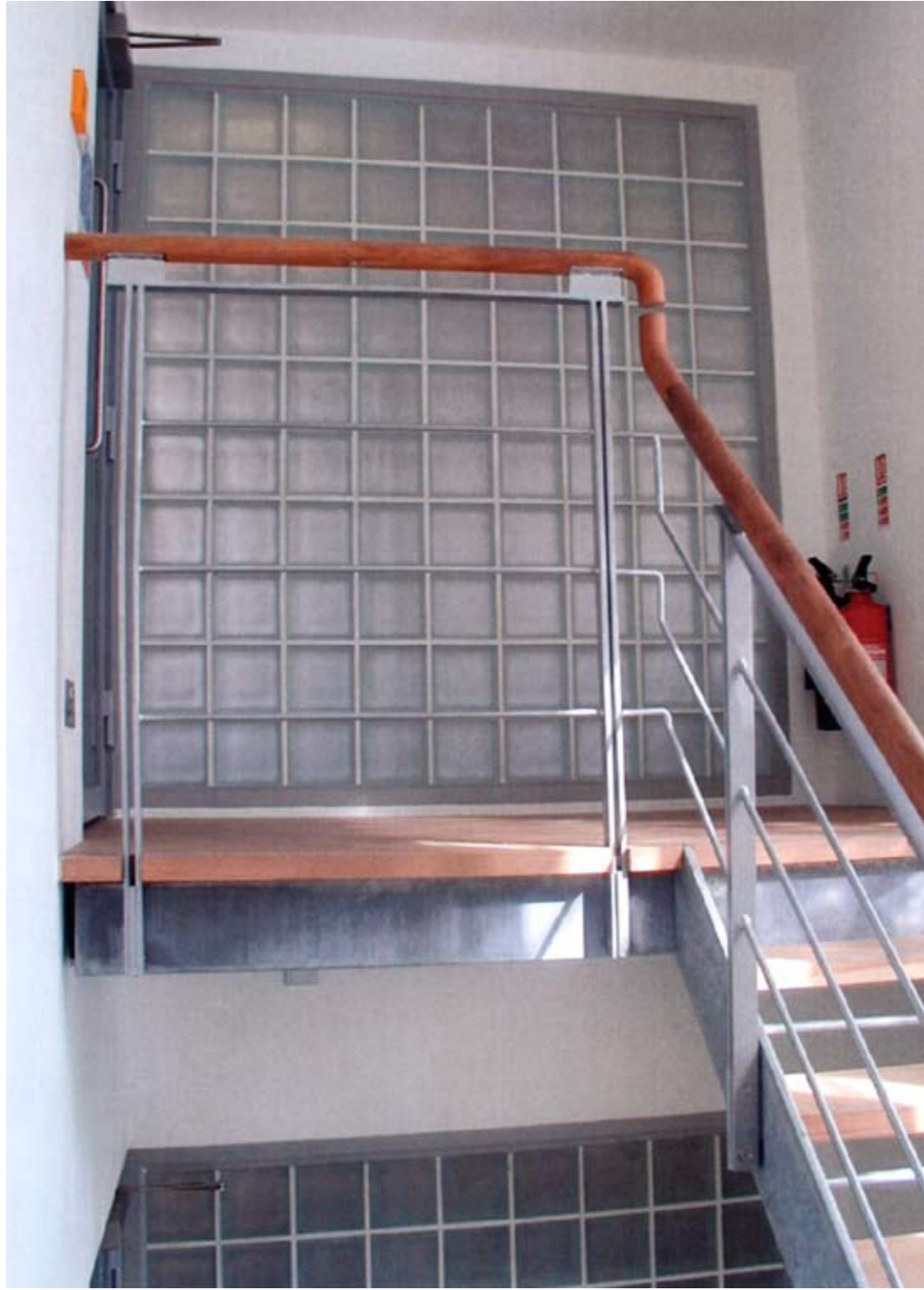
Left: new stair and circulation core, 9-12 Bow Street