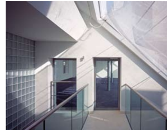
Right and below, left: bridge link through new Atrium, 56 Long Acre

The challenge of the project was to maximise the potential of each of these individual and quite different buildings, in a sensitive way. The building types varied from small domestic-scale terraced houses to large purpose-built warehouses, formerly used for potato storage in the period when Covent Garden was a fruit and vegetable market.