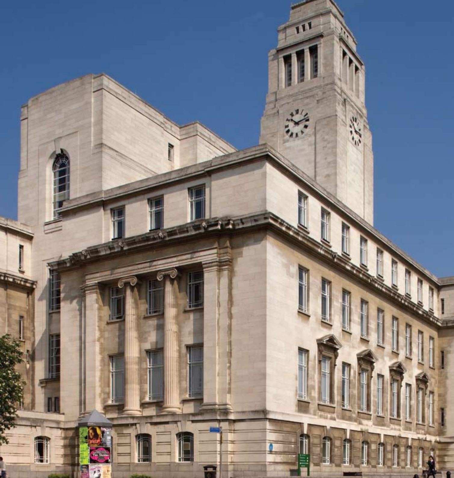
THE STANLEY AND AUDREY BURTON GALLERY, UNIVERSITY OF LEEDS, LEEDS