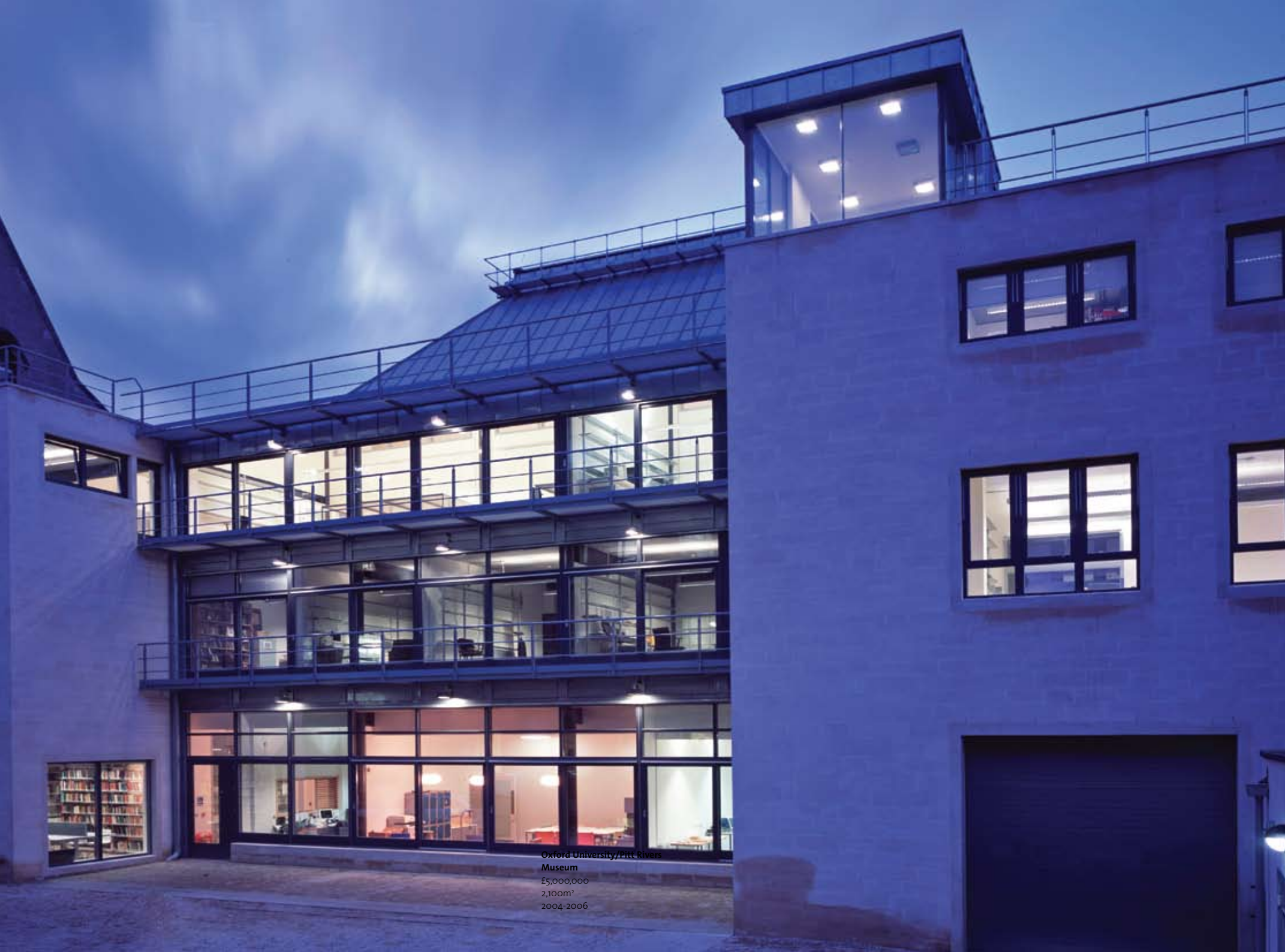
Oxford University/Pitt Rivers Museum £5,000,000 2,100m 2 2004-2006