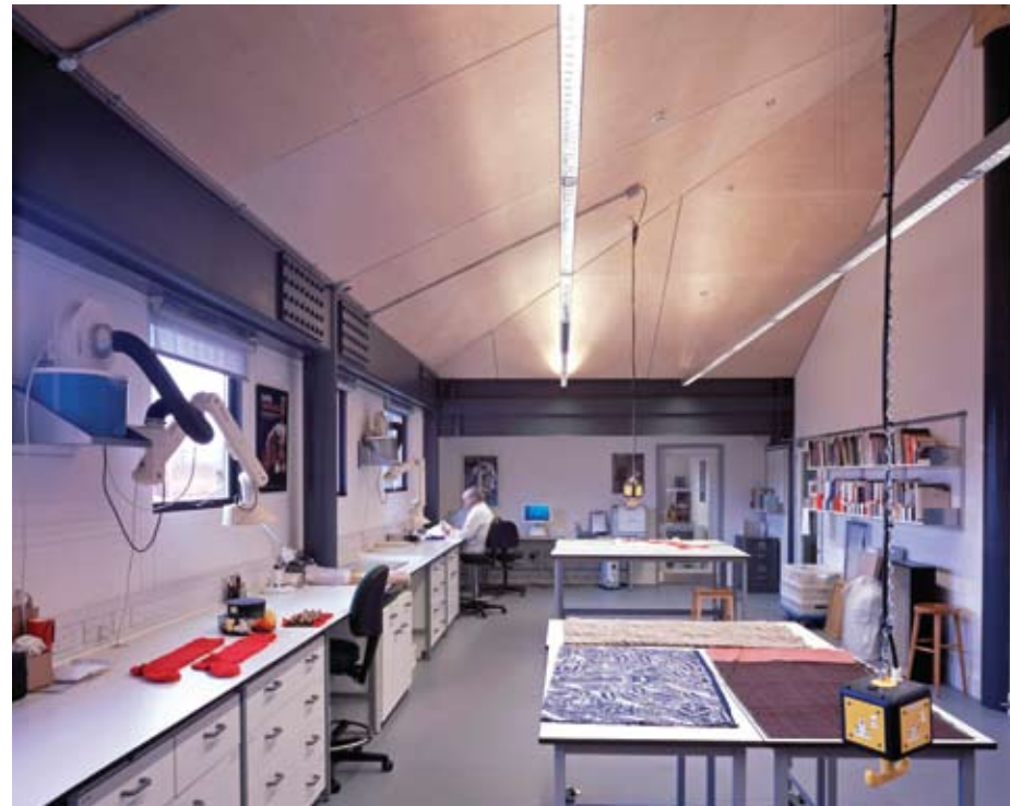
Above: Conservation Studio