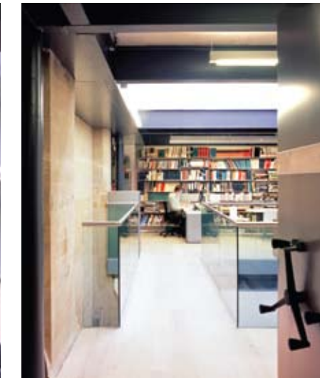
Left & Above: Balfour Library