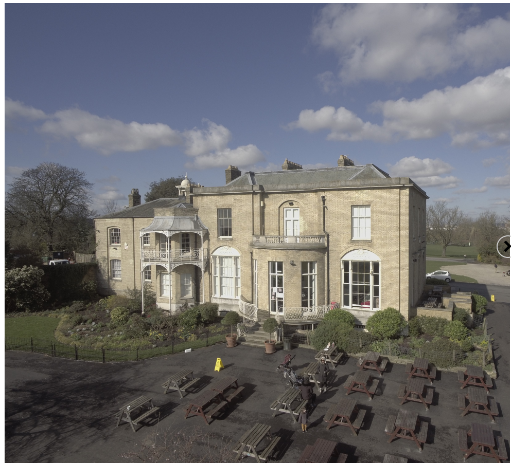
1/7 Brockwell Hall

Pringle Richards Sharratt has won a competition for a £6 million overhaul of Grade II*-listed Brockwell Hall in Brixton