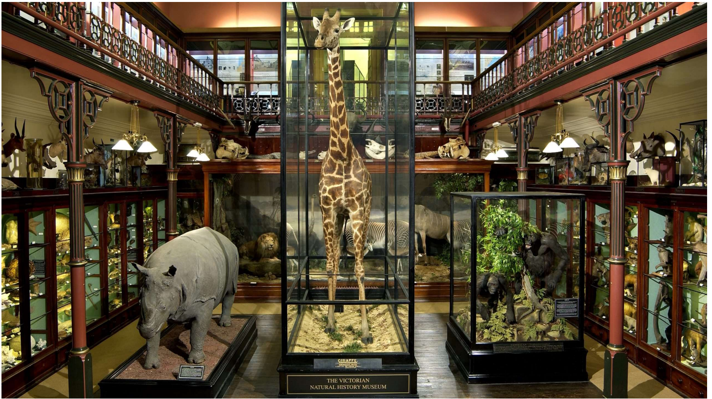
The Victorian taxidermy displays will be entirely reinterpreted and redisplayed by 2025

Ipswich Museum in Suffolk has received lottery funding to support a major redevelopment.