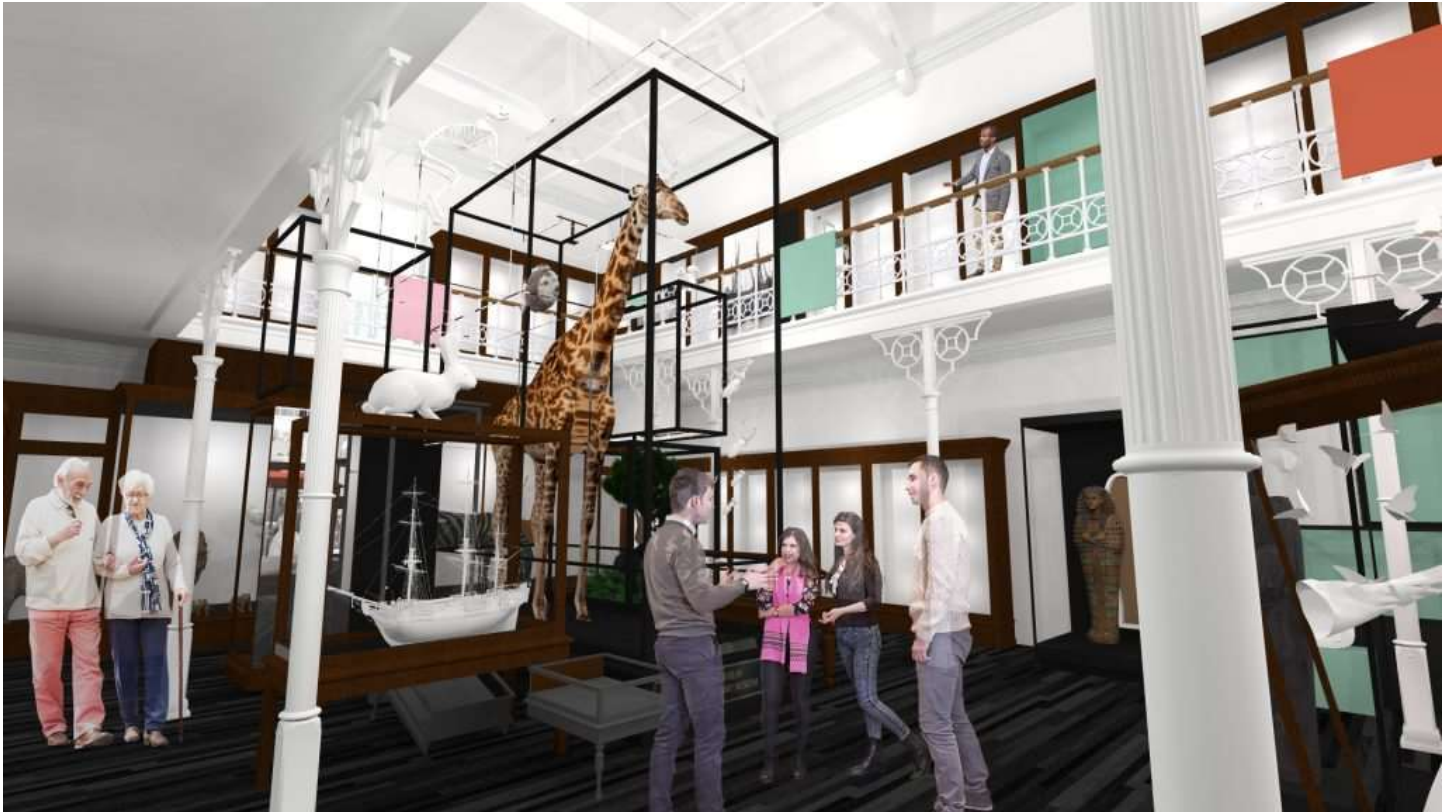
A projection of the new Wonders gallery when the museum reopens

the museum's environmental and sustainable performance.